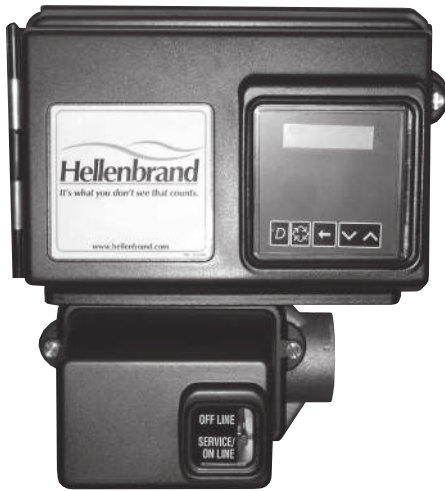
TN2 “NXT” Microprocessor System